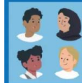
7. Present yourself