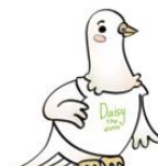
Being peacemakers Promoting peace