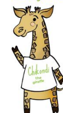
The Common Good