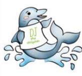
Sharing fairly Distributive Justice