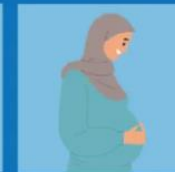
9. To have a baby