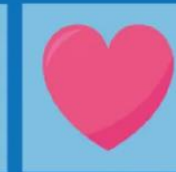
8. Who you choose to love