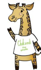
The Common Good