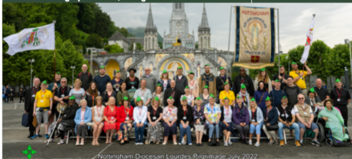
Nottingham Diocesan Lourdes Pilgrimage July 2022